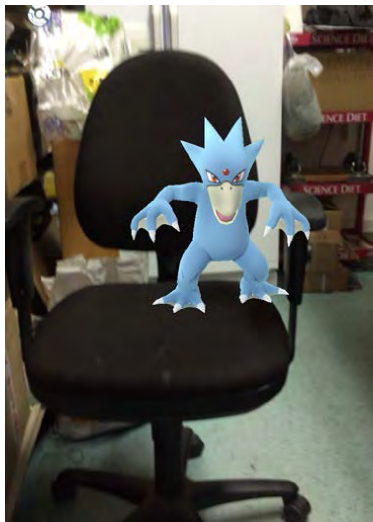
A Golduck relaxes in the Rheem Valley Pet Shoppe.

Whether it's at the Lafayette Park Plaza, the Orinda Library, or the Moraga Commons, herds of gamers can be seen roving the community in pursuit of virtual creatures on their smartphones. The Pokémon Go craze has hit Lamorinda along with the rest of the nation as players of all ages feel they "Gotta catch'em all!" as the old Pokémon theme song declared.